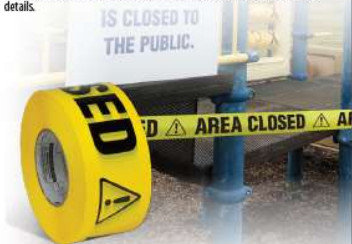
BT10213 (3" x 1,000')

Custom text and graphics also available. Contact customer service for more details.