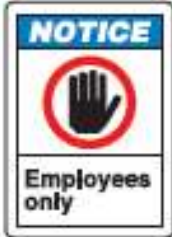
ANS4000P (14"x 10")