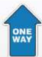
FS1022V (17"x 12.5")