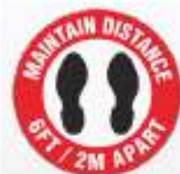
FS1045V (17" Dia.)