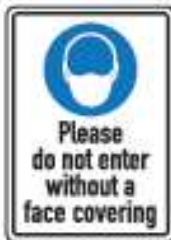
SS5094V (14"x 10")