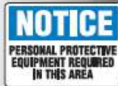
SA4051V (7"x 10")