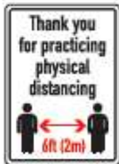
SS5093V (14"x 10")