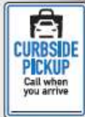
SS5092V (14"x 10")