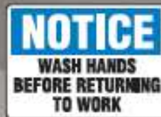
SA4067V (7"x 10")