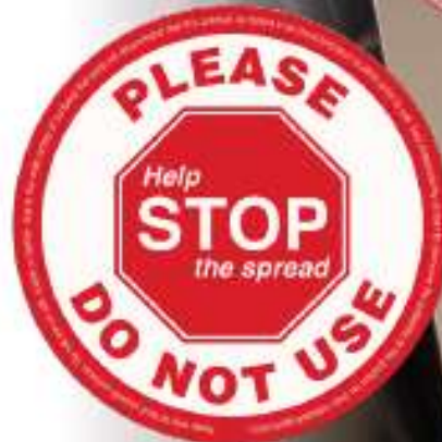
DEC200 (5.125" Dia. Circle) 25/pkg

Custom text and graphics also available. Contact customer service for more details.