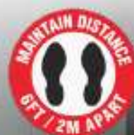
FS1045OD (17" Dia.)