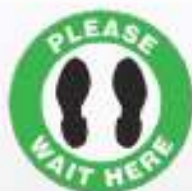
FS1046V (17" Dia.)