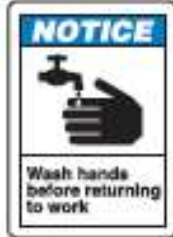
ANS4002P (14"x 10")