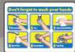
SA5081V (7"x 10")