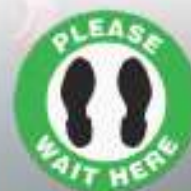
FS1046OD (17" Dia.)