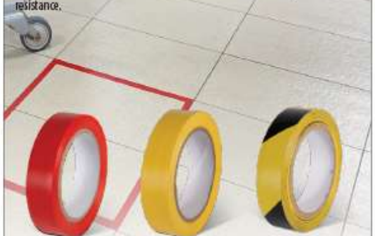
PST112 (1" x 108') Safety Red

Our Floor Marking PVC (vinyl) Tapes are made from a durable vinyl film with a rubber adhesive system that will adhere to most any clean, dry surface. Vinyl offers a matte smooth conformable tape that is great for marking hazards on floors, walls and equipment. Commonly used in aisle demarcation, color coding and pipe banding applications. All tapes are made in a wide array of OSHA colors that meet ANSI Z535.1 and offer excellent durability and chemical resistance.